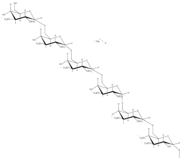
Fig. 1 Structural representation of a fragment of dextran sulphate sodium (DSS)